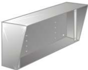
external stainless steel enclosure